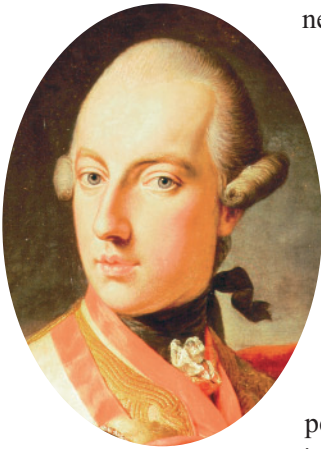
▲ Joseph II

Catherine eventually put in place limited reforms, but she did little to improve the life of the Russian peasants. Her views about enlightened ideas changed after a massive uprising of serfs in 1773. With great brutality, Catherine's army crushed the